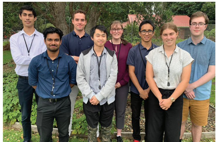
Over the summer, we welcomed eight university interns to the plant. We gave them hands-on work experience, mainly in our technical department. In return for the real-world engineering experience we offered, they offered our team fresh perspectives and energy.