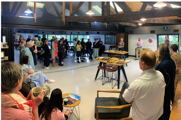
On International Women's Day, we celebrated the amazing wāhine in our Methanex whānau. From engineers, operators, accountants and much more, we have many very valued female staff whose work keeps the plant and business operating so successfully.

maximum air contact. As the water is exposed to the air, some of it evaporates and causes the remaining water to cool down. The cooler water is then collected and reused in the process, while the warm, moist air is released into the atmosphere through the top of the tower. This is the steam you can see from our plant. It's often thought that these big plumes are harmful air emissions, but they're just water.