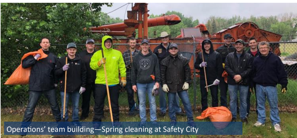
Operations' team building—Spring cleaning at Safety City