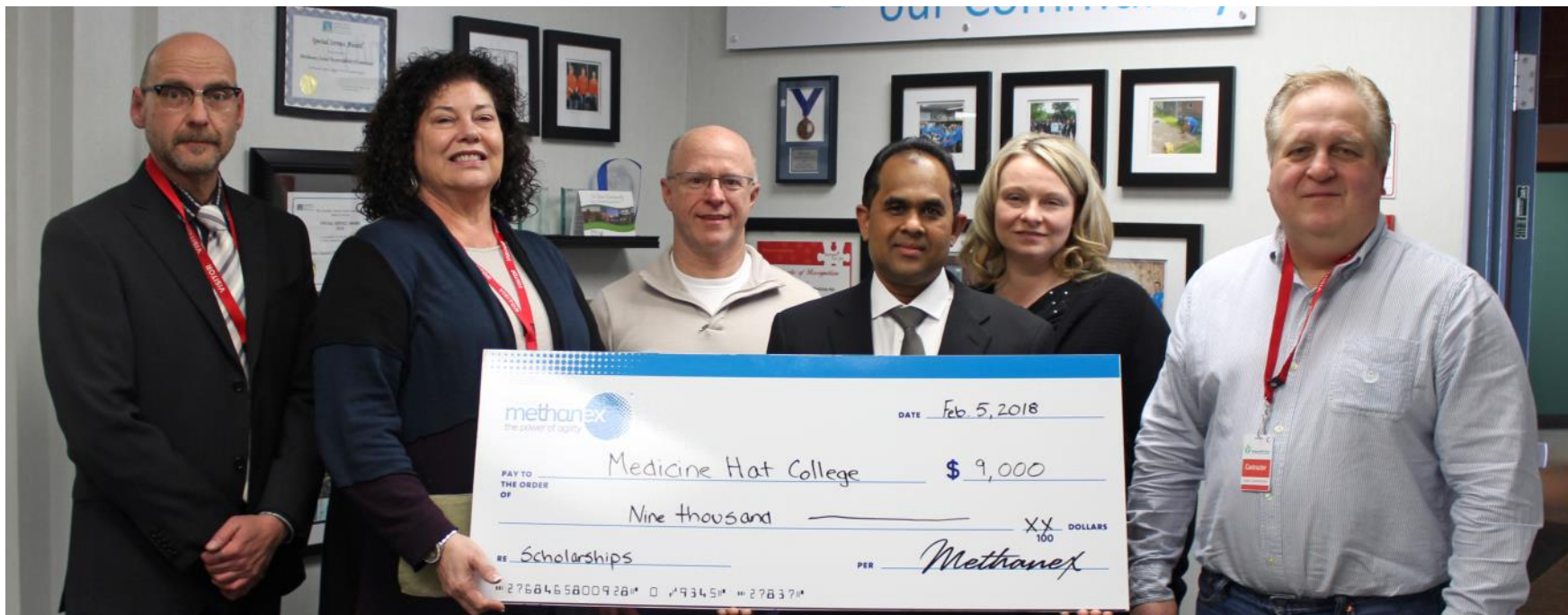
(Photo) Methanex presents the Medicine Hat College with a three-year, $9,000 scholarship pledge.