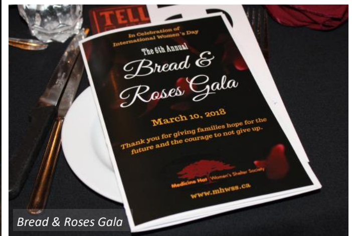
Bread & Roses Gala