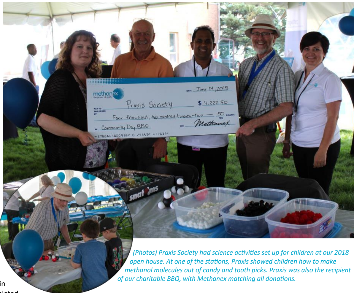
(Photos) Praxis Society had science activities set up for children at our 2018 open house. At one of the stations, Praxis showed children how to make methanol molecules out of candy and tooth picks. Praxis was also the recipient of our charitable BBQ, with Methanex matching all donations.

The module is available on Minerva Canada's website .