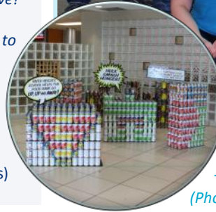
(Photo left) Methanex sponsored River Heights Elementary School's participation in the 2018 CanStruction competition.

"This is a very meaningful program, as it demonstrates Methanex support for our efforts as employees within the community. It's nice to see the company providing support for the organizations that are near and dear to our hearts as employees. Thanks so much to Methanex for supporting my volunteer choices in this way."