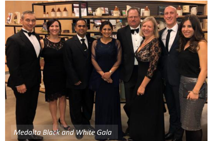
Medalta Black and White Gala