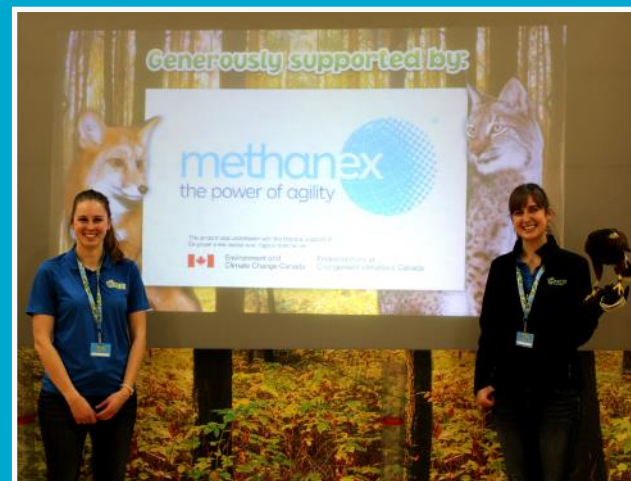
(Photo right) The School Assembly Program presenters pose for a photograph with one of their animal ambassadors following their presentation at St. Patrick's School.

Methanex's sponsorship allowed the program to be presented at three elementary schools in Medicine Hat. The assembly program was presented to approximately 995 students at CAPE, Dr. Roy Wilson Learning Centre, and St. Patrick's School. All recipient schools were nominated by Methanex employees.