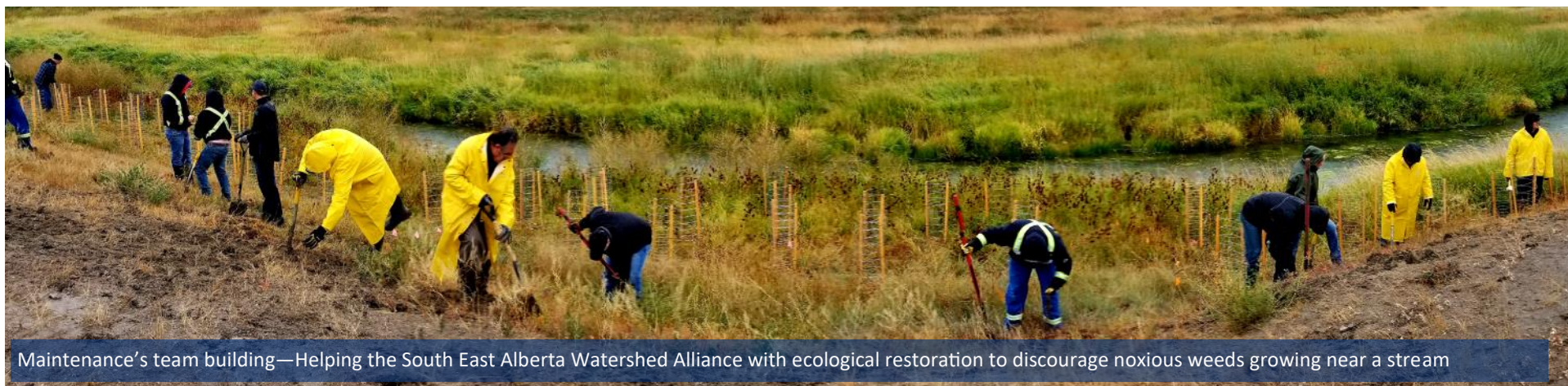
Maintenance's team building—Helping the South East Alberta Watershed Alliance with ecological restoration to discourage noxious weeds growing near a stream