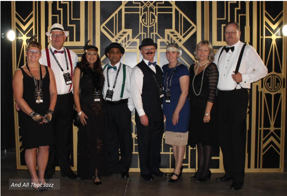
And All That Jazz